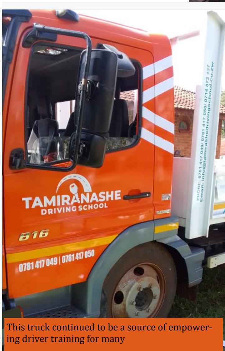
This truck continued to be a source of empowering driver training for many

that breaking the cycle of poverty does not just start and end with the education of children, but also the skills empowerment of their parents.