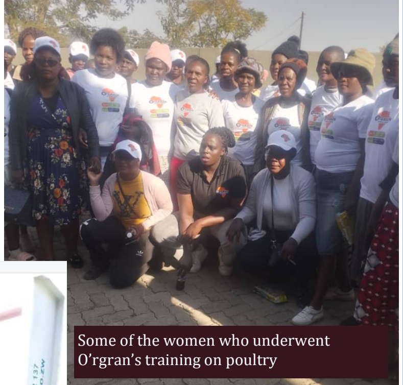
Some of the women who underwent O'rgran's training on poultry