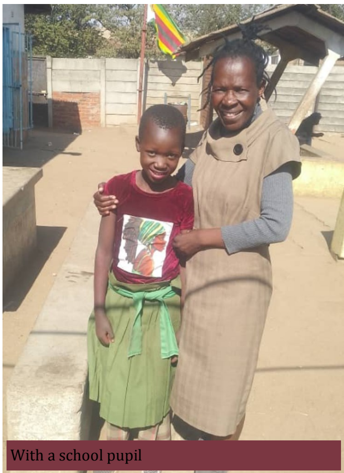
With a school pupil