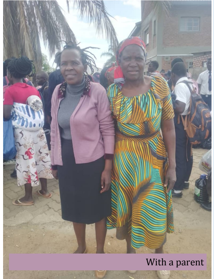
With a parent